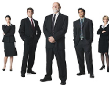
Now executives can access the liquidity of their Restricted Securities.

such companies. Rule 144 says a lot, but probably the most noteworthy is that a restricted shareholder cannot sell more than 1% of the company's total outstanding shares every 90 days. For some this isn't always such a bad deal, but for most it is liken to wearing solid gold handcuffs.